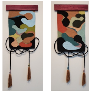
Coalescence 1 & 2 Textile and purple heart 45 x 19 inches each 2024