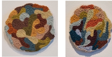
Amoebas 1 & 2 Embroidery Sizes Variable 2024