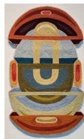
Nesting Embroidery 26 x 16 inches 2024