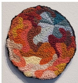
Amoebas 3, 4, & 5 Embroidery Sizes Variable 2024