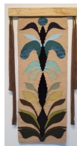
Cultivate Textile and spalted tamarind 48 x 24 inches 2024